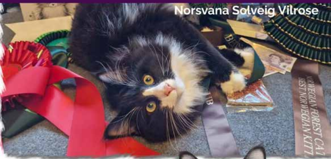
Norsvana Solveig Vilrose

So many cats I could have taken home on the day. One was WOODS NORSVANA SOLVEIG VILROSE, an eight months old kitten, who ended up becoming Overall Best in Show, she is a real cracker with a wonderful expression. Another was my Female AOC Neuter, ROSE'S PR BOSTINFOREST TYRA, so close to getting BOB, but the one that stole my heart, definitely my "take home neuter of the day". And I fell in love with DINSDALE'S MAYSULA SMARTY PANTS, he was a real entertainer when we had him in a side class, I think he had his eyes on taking my teaser home with him after the show. My list could go on and on.